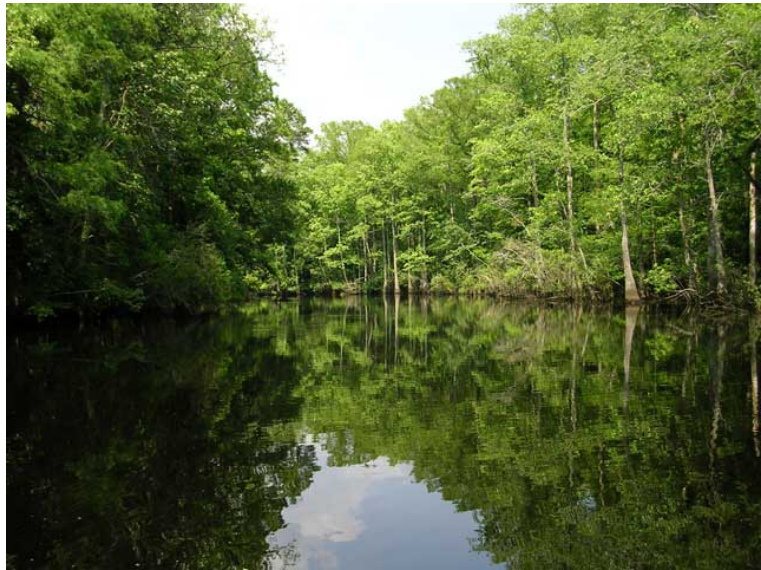
Gardner's Creek – Tributary of the Roanoke River

A mule named "Frank" – a reminder of days when mules were essential to Martin County agriculture. Horses have long replaced mules as an economic and cultural mainstay. The Sen. Bob Martin equestrian arena is the largest equine facility in N.C. Horse events take place almost every week and bring over 100,000 visitors to Martin County annually.