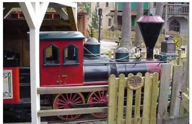
"Iron Horse" at Deadwood Grill One of the many sites on the Historic Albemarle Tour N.C.'s oldest self-guided Heritage Trail