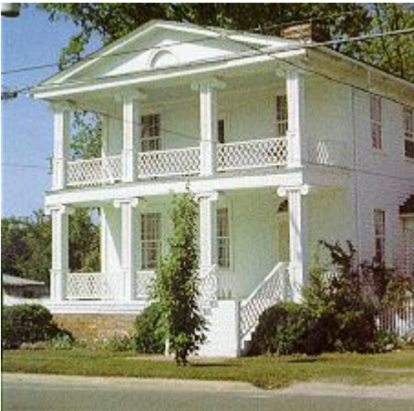
Darden Hotel in Hamilton

Martin County is fortunate in having a variety of accommodations & restaurants. There are charming B&B's as well as an array of fine motels able to serve motorcoach tours with ease. The Website VisitMartinCounty.com has exceptionally detailed information about sites and facilities.