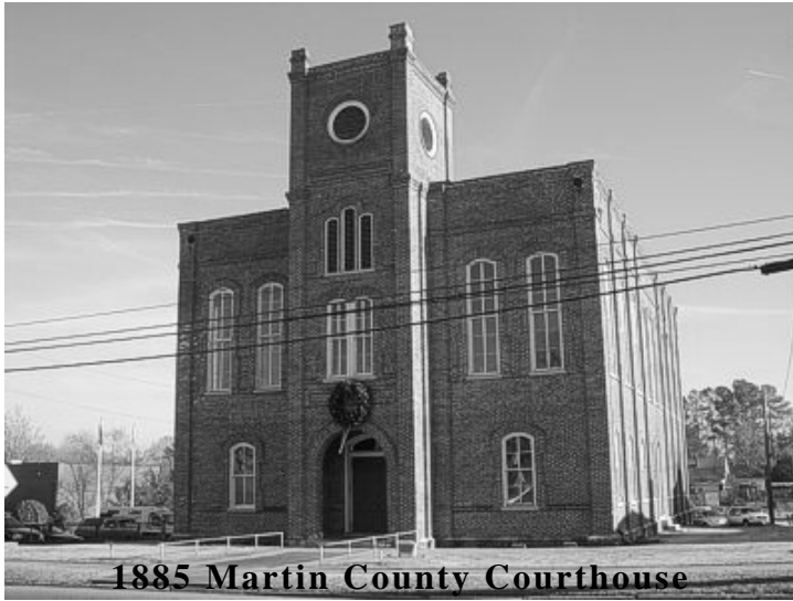
1885 Martin County Courthouse

The Old Martin County Courthouse is one of the 27 oldest courthouses in N.C. and one of a dozen built between 1860 and 1900. It blends Italianate, Medieval and late Victorian architectural elements. Restoration of the first floor is complete.