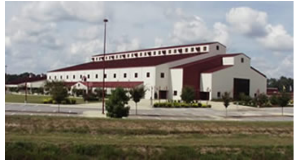
Sen. Bob Martin Eastern Equestrian Center

It was the commercial hub for vast farming enterprises that continue to the present day.