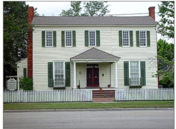
Martin County Tourism Office & Visitor Center in the 1831 Asa Biggs House