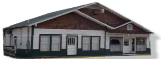
Sunnyside Oyster Bar (1935)